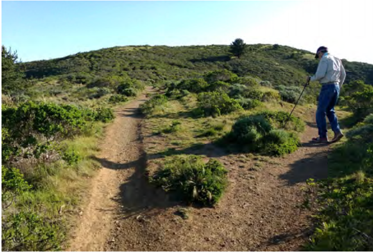
Example of Social Trail