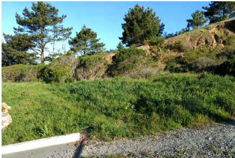
Cattle Hill Swale Designed to Catch Run- Off from Road