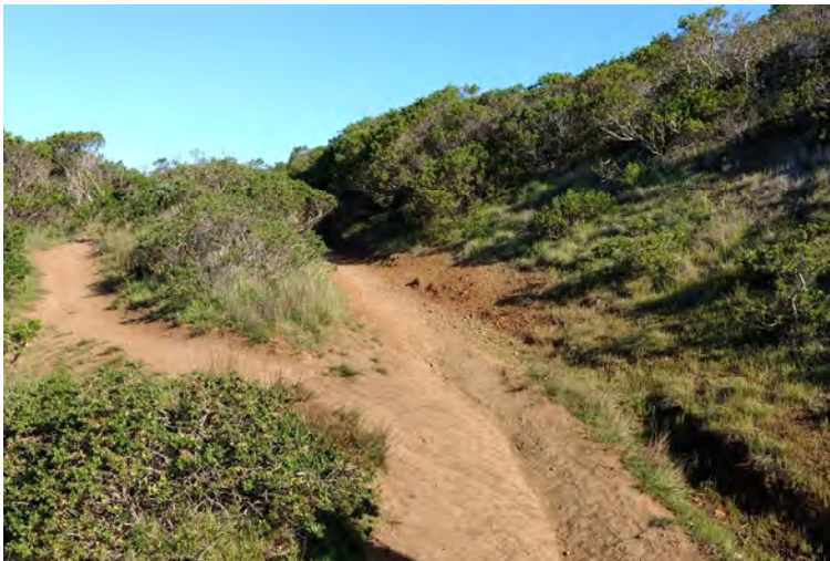
Deeply Rutted Trail with Social Trail