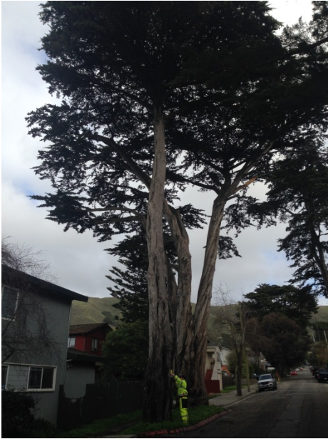
1090 Mirador Terrace