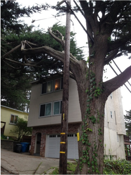
1101 Mirador Terrace