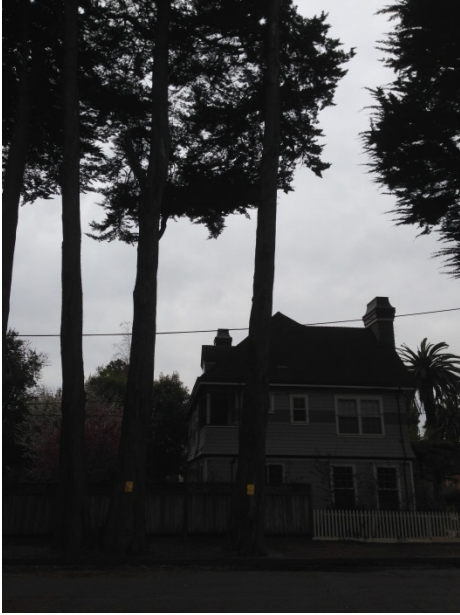
648 Reina Del Mar