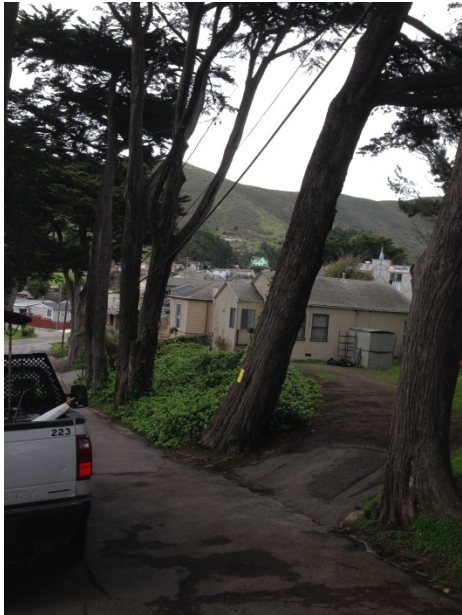
909 Vallejo Terrace