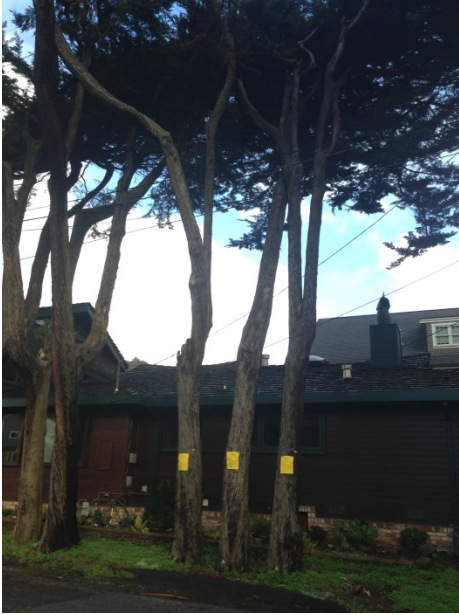
753 Reina Del Mar