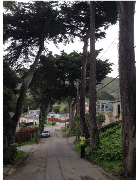
909 Vallejo Terrace