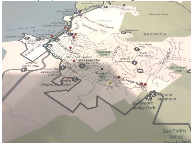
Figure 5 - Pedestrian issues activity board

This station continued to reinforce that many pedestrian improvements are needed along Highway 1, with multiple locations marked as uncomfortable and missing sidewalks in the area of the Sharp Park Golf Course. Additional hotspots included Reina Del Mar Avenue, Linda Mar Boulevard, and Crespi Drive.