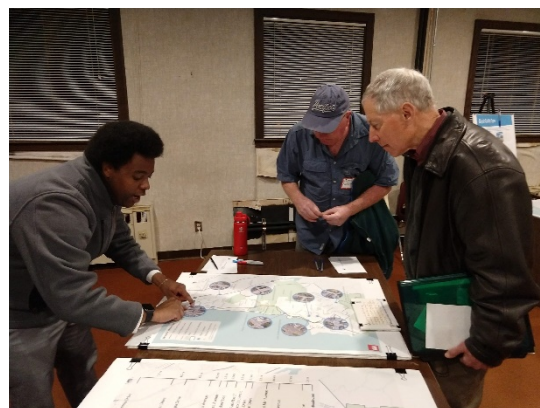
Figure 2- Project staff engaged with community members and answered questions on findings