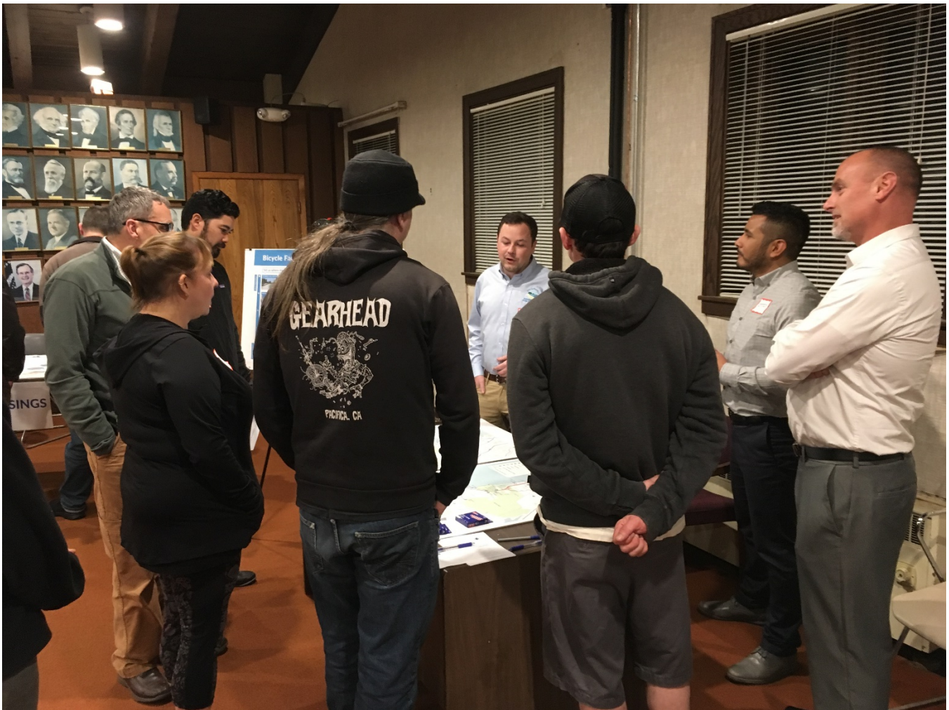
Figure 4 - Members of Pacifica Public Works, Alta, PBRC, and the public reviewing bicycling challenges in Pacifica Palmetto Avenue to the north into Daly City and by providing an alternative route through Mori Point in addition to the Class I trail. Avid cyclists feel that it is not a viable option due to the amount of dog walkers that often use the trail.

This activity gathered several comments that were recorded on the LTS activity map. Many comments on Pacifica's existing bicycle facilities requested better access to trails and parks. For example, one avid mountain biker mentioned that the plan should allow for coordination between the City and Golden Gate National Recreational Area (GGNRA) to allow bicycles to access the gates through to the Sweeney Ridge Trail. The same person requested better access from Pedro Point through Shamrock Ranch to the south. The topic of providing better north-south connectivity was mentioned by way of connecting the bike network on