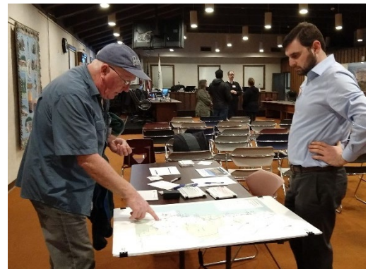
Figure 1- Welcome station at the Study Session

As attendees entered the room, they were asked to pin where they live and destinations that they currently or desire to walk or bike to. A wide array of destinations were added to map, on both sides of Highway 1, further emphasizing the need to improve crossings of Highway 1. Attendees at this meeting came from across the City, from Edgemar south to Linda Mar.