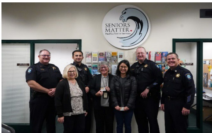
Turkey Too from the Folks in Blue!