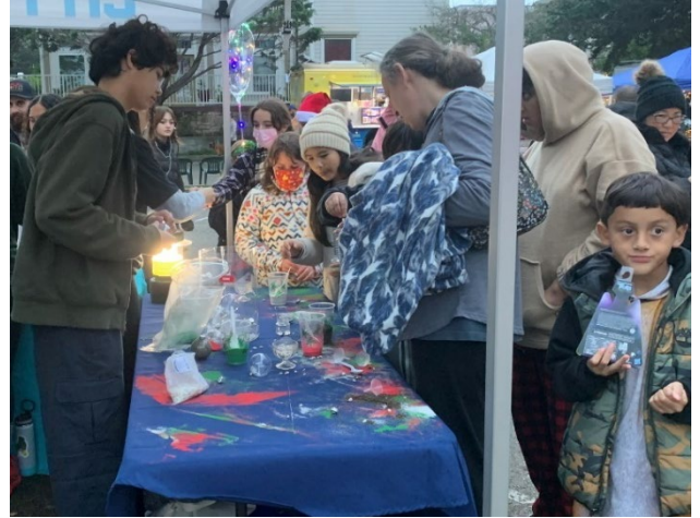
Recreation Staff and Youth Advisory Board Members Facilitating Activities at Rockaway Tree Lighting