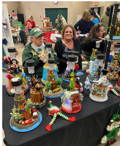
Above and left: Vendors at the Elf Market