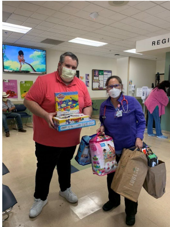
Coastside Clinic Staff Accepting Toy Drive Donations