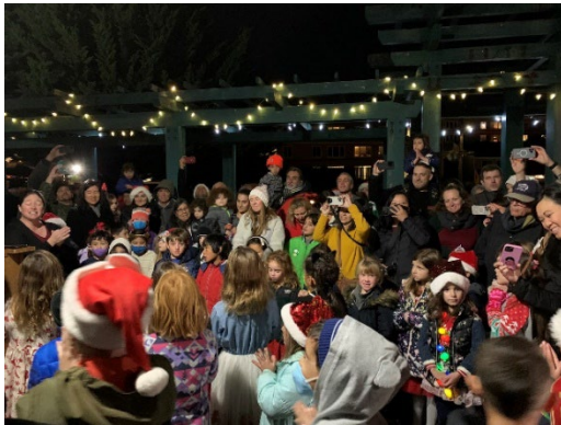
Above: Attendees at the Community Center Building Lighting

After the building lighting event, nearly all spectators came into the Community Center for hot apple cider, hot chocolate, and for the start of the Elf Market. 42 vendors curated booths around with handmade goods, which attendees thoroughly enjoyed. Vendors generally reported success in selling their items, and we received a lot of positive feedback from customers and vendors alike on operations of the Elf Market. Even with a very rainy Saturday, vendors still mostly reported receiving a satisfactory amount of foot traffic. Some vendors commented that they felt consumer attendance took somewhat of a dip during the rain, and a few told the department that they would like to see an earlier closing time on Friday and more promotion for the event in the future, which we will certainly consider and work to improve upon moving forward.