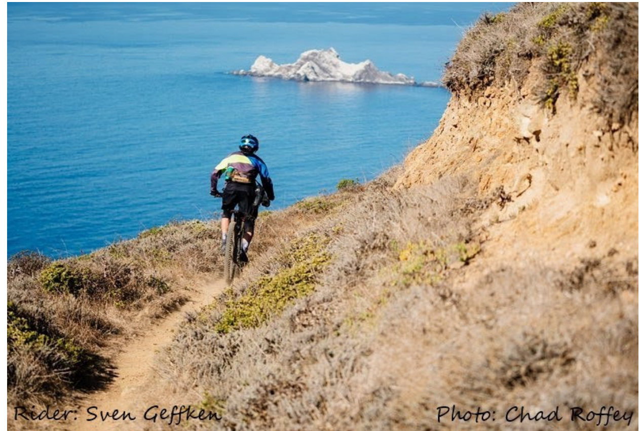
Rider: Sven Geffken

The City of Pacifica provides exceptional services, maintains the small-town feel and safety of its unique community, and stewards its environment, coastal beauty, and recreational opportunities.