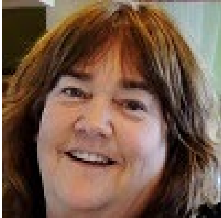
Mayor Sue Vaterlaus