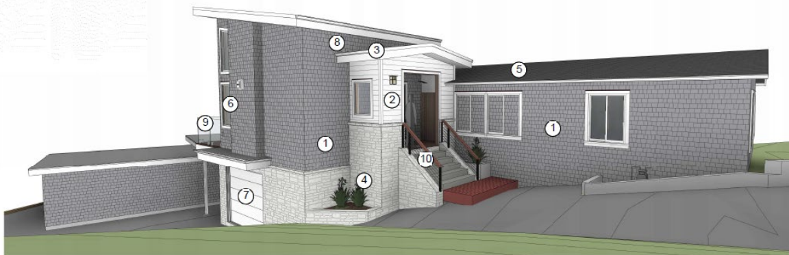
1 MATERIALS PERSPECTIVE