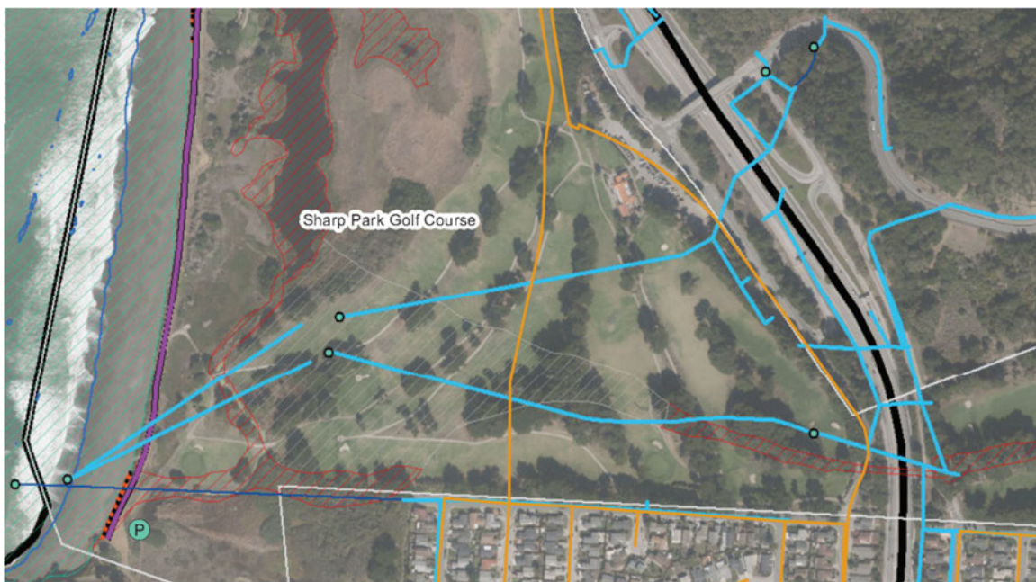
Detail, showing Pacifica stormwater infrastructure (in blue), from Appendix A-4, Pacifica LCP Update, Existing Conditions Map, Sharp Park, West Fairway Park, and Mori Point

An existing conditions map compiled by Pacifica's Local Coastal Plan consultant ESA, shows the city's storm drain infrastructure (in blue lines), including three street gutter drains along the southwest shoulder of Bradford Avenue adjacent to the golf course, whose drain lines extend beneath the golf fairways to the edge of the Laguna Salada wetlands.